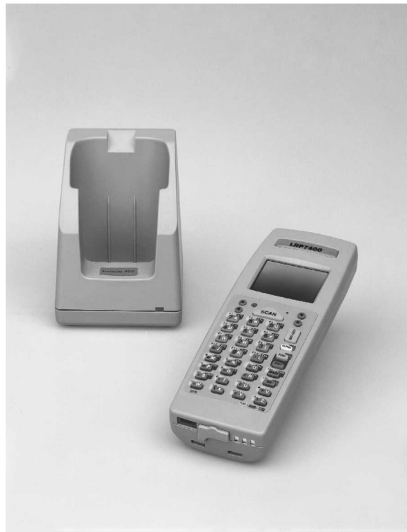
LRP7400 and F970 Transceiver/Charger

RS232 serial mode data transmission is provided by placing the terminal into the F970 Transceiver/Charger or by connecting the PC, modem, printer or any other equipment directly to the RS232 port, already integrated into the LRP7400.